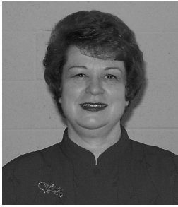
Impressions from ... The Director of Family Ministries

Have you ever taken a “staycation?” That relatively new term usually refers to taking time off work and exploring interesting sites that are very close to your own home. Recently, FCC became the perfect destination for an exciting staycation that was enjoyed by an energetic inter-generational group that traveled to Africa without leaving Royal Oak! More than one hundred people, age one through eighty, were included in the adventure, which was also known as Vacation Bible School Prayer Safari 2011.