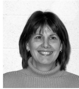
From the Director of Pastoral Care Ministries